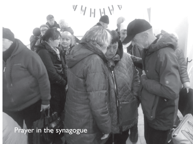
Prayer in the synagogue

they need in the store, except for alcohol and tobacco. We also used the meeting in the synagogue to announce the Good News of the Passover Lamb. At the end of the meeting, 4 people came to pray for the purification of their sins and the acceptance of the Lord Jesus into their hearts as their personal Saviour and Lord.