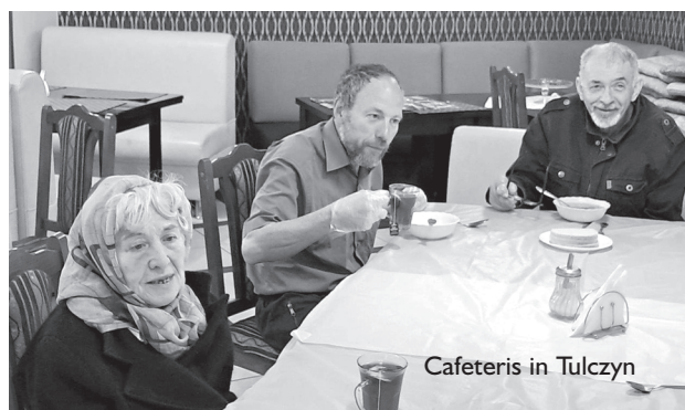
Cafeteris in Tulczyn