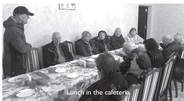
Lunch in the cafeteria