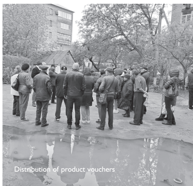
Distribution of product vouchers

Then we went to the square in front of Rita's house, where people waiting for food stamps gathered. Before passing out the vouchers, we told them the testimony of Rita, who believed in Yeshua as the Passover Lamb. We are grateful to God that all gathered people could hear the gospel of salvation first of the Jew, then of the Greek. ... it is the power of God that brings salvation to