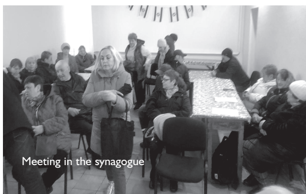
Meeting in the synagogue

When we arrived by train from Przemyśl to Vinnytsia, we went to Zhmerynka for a long day, where we met our dear friends in the synagogue. There we could give away vouchers for products instead of food packages. This is a very good solution because these people can buy the products