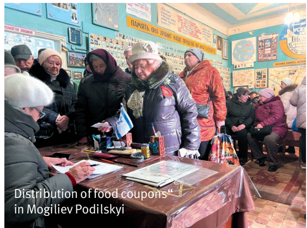
Distribution of food coupons in Mogilev Podilskyi

Holocaust Museum, which they maintain with great care to honor their history. Following a warm welcome, we enjoyed individual conversations where many people shared their heartfelt gratitude for the food coupons they received. Those who benefit from the canteen expressed their sincere appreciation for the vital support it provides.