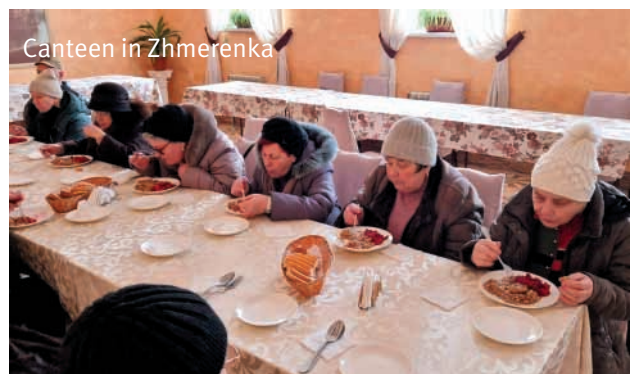
Canteen in Zhmerenka

Zhmerenka, once a bustling center of trade and industry, has a rich history of Jewish life. Over the years, its Jewish community played an essential role in the local economy, but today, like many other Jewish communities, it faces challenges due to poverty, worsened by the ongoing war and social instability. That's why our work here is so crucial! We not only help meet basic needs but also bring hope and peace to those we serve. The canteen we established has become a warm gathering place where people can fulfil their needs and find a sense of community and stability.