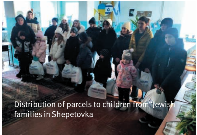
Distribution of parcels to children from Jewish families in Shepetovka

and words of encouragement – your prayers and support mean so much to all of us!