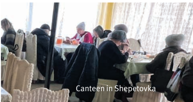
Canteen in Shepetovka

After our visits, we headed to the canteen for a lovely dinner, where we had the chance