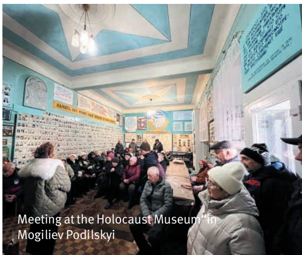
Meeting at the Holocaust Museum in Mogilev Podilskyi

After we arrived, we met with many members of the Mogilev Jewish community at the