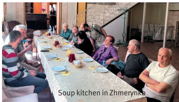
Soup kitchen in Zhmerynka

While in Zhmerynka, we also visited the soup kitchen we've supported for many years in this city. There we met with many of our dear friends who benefit from this assistance. Please accept from them heartfelt expressions of gratitude and every blessing for your open hearts and practical support, through which this soup kitchen is able to function. For many lonely and sick individuals, this help is real