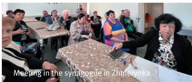
Meeting in the synagogue in Zhmerynka

It was a wonderful opportunity to speak with them and to pass along greetings and expres-