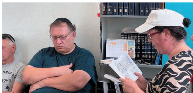
Reading of the Book of Ruth in the synagogue in Zhmerynka

But Ruth replied: Don't urge me to leave you or to turn back from you. Where you go, I will