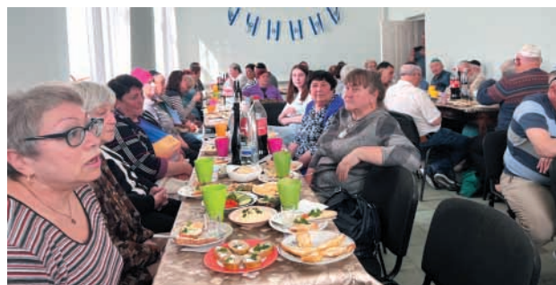
Joint celebration of Shavuot at the synagogue in Zhmerynka

For us, this was a deeply moving and symbolic moment. This experience filled our hearts with gratitude, and the example of Ruth — her devotion, love, and willingness to become part of God's people, Israel — will remain forever etched in our memory. At that time, with thankful hearts, we thought of all of you —