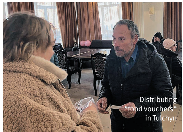
Distributing "food vouchers" in Tulchyn

During our stay in Ukraine we also traveled to Tulchyn. By God's grace and thanks to your care and support, a canteen operates there for the most needy members of the Jewish community in that city. This time we also came to Tulchyn to distribute food vouchers to all those in need. We also visited people whom we help in their homes.